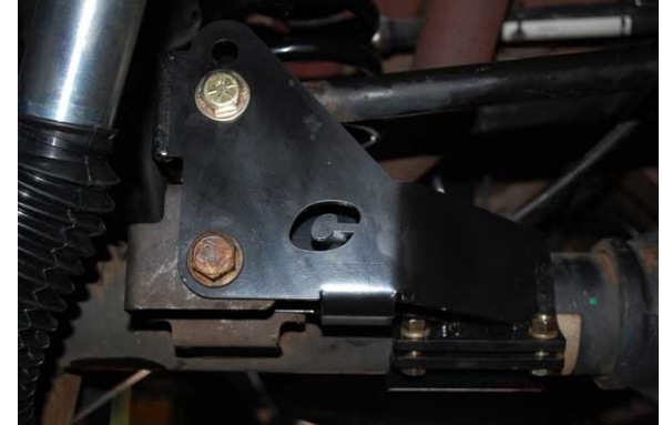
Tighten trackbar, and check for any clearance issues during articulation cycle.