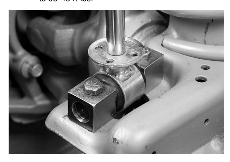
©2013 JKS Manufacturing, Inc & Aftermarketing, LLC Revision Date 10/30/2013